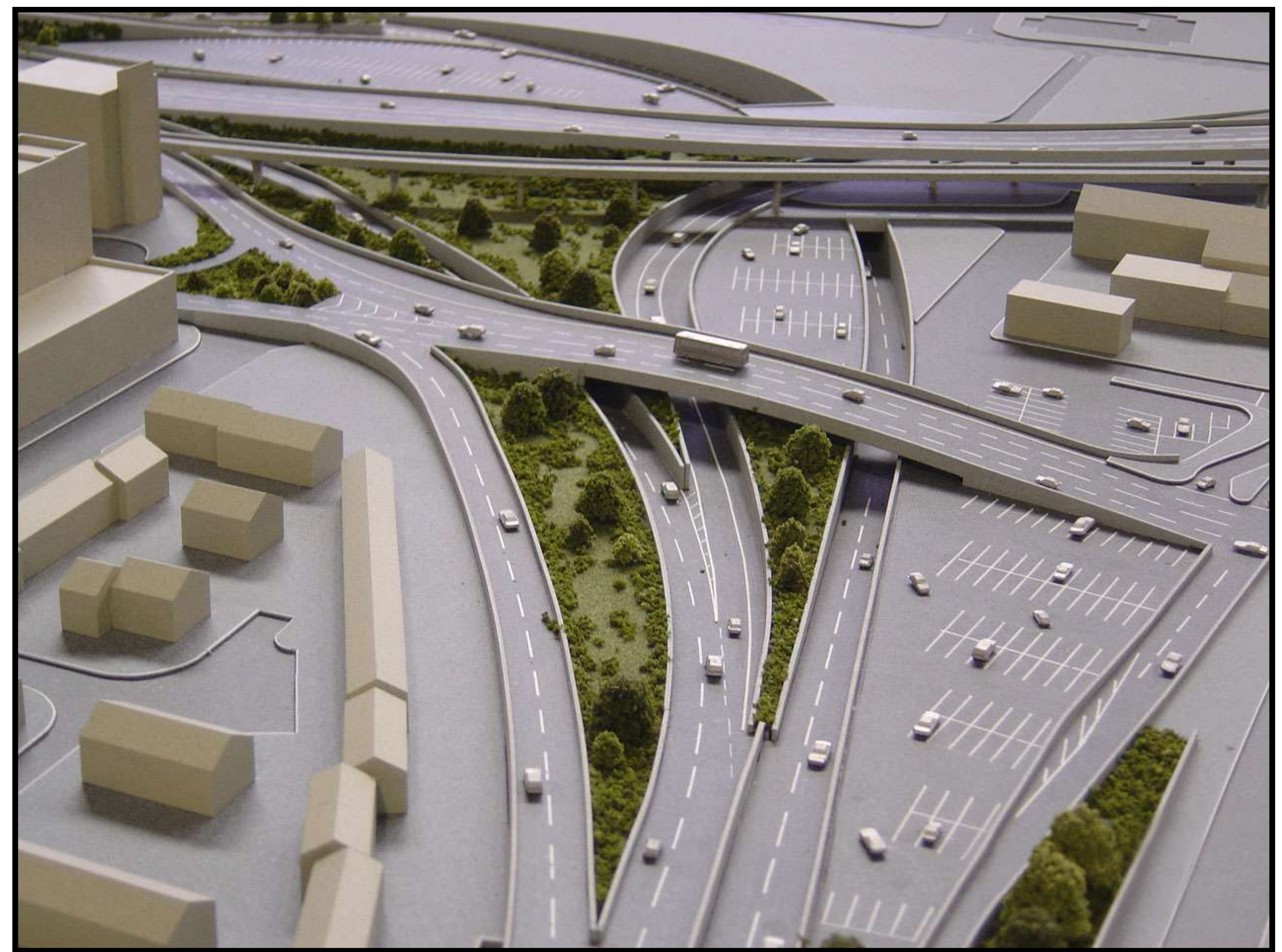
2005 York Street Interchange Model

The feasibility study culminated with the publication in 2005 of the Traffic Management Options Report and the Preliminary Appraisal Report.